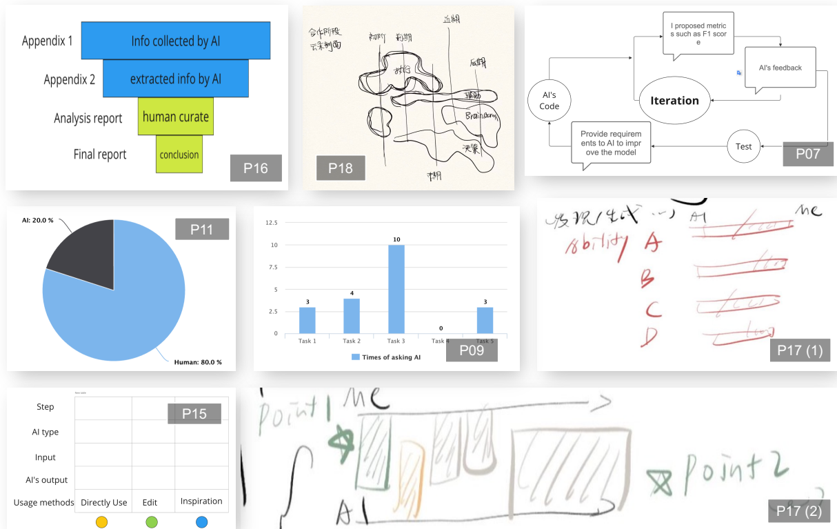
Figure 3: A subset of designs of the reporting of students' AI usage resulted from step 2 of activity 3 of the co-design workshop. We explain the designs when we mention them in the main text.